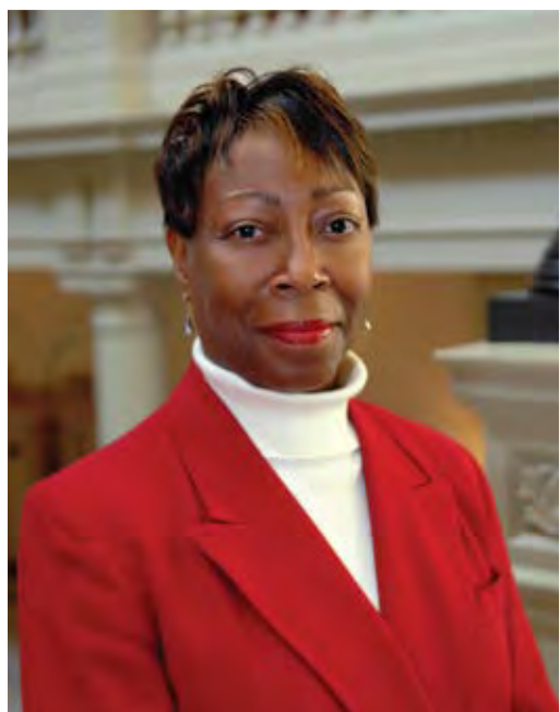
Senator Freddie Powell Sims District 12