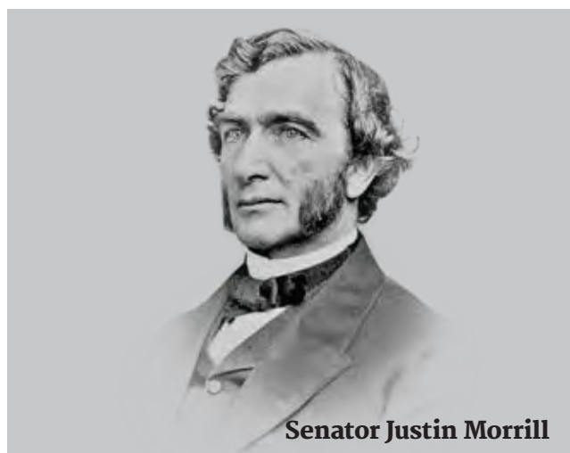
Senator Justin Morrill

Furthermore, Fort Valley State continued to grow as a land-grant university in the 21st Century. In 2005, a permanent facility at the Sunbelt Agricultural Exposition opened, followed by the opening of the Agricultural Technology Conference Center in 2008. The year 2010 saw the College's name change from the College of Agriculture, Home Economics and Allied Programs to the College of Agriculture, Family Sciences and Technology. Lastly, the State Animal Facility for Emergencies (SAFE) Center, the only one of its kind in the Southeast U.S., opened its doors in 2012.