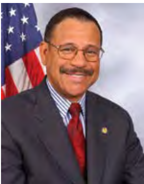
Congressman Sanford D. Bishop, Jr.