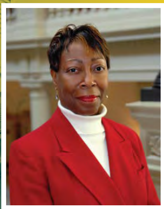
Senator Freddie Powell Sims District 12