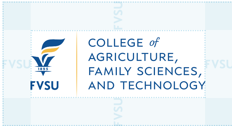
SPACE DEFINED BY WIDTH OF “FVSU”